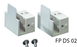
FP DS 02