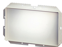
FP AP 10