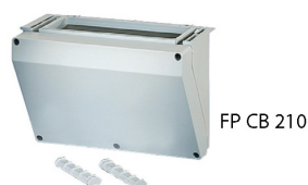
FP CB 210