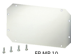
FP MP 10