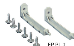
FP PL 2