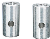
KV PL 3