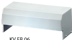
KV EB 06