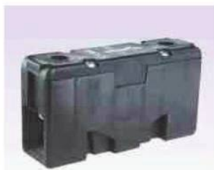
Main pole 80A-125A