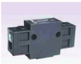
Main pole 16A-63A